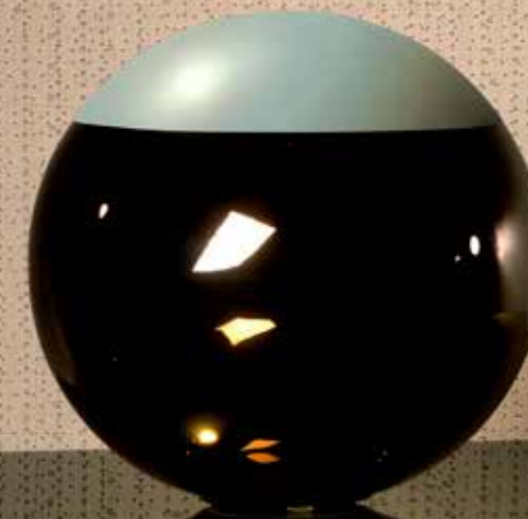
Orion # 67289

The portrayed colours may differ from reality.