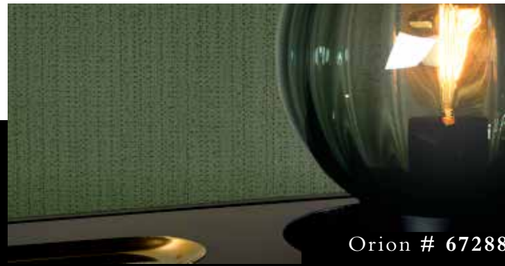
Orion # 67288